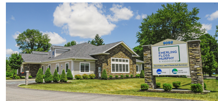
EFM CLARENCE BRANCH

To learn more about EMS Group, visit emsinsurance.com , or you can visit our website, efm-agency.com .